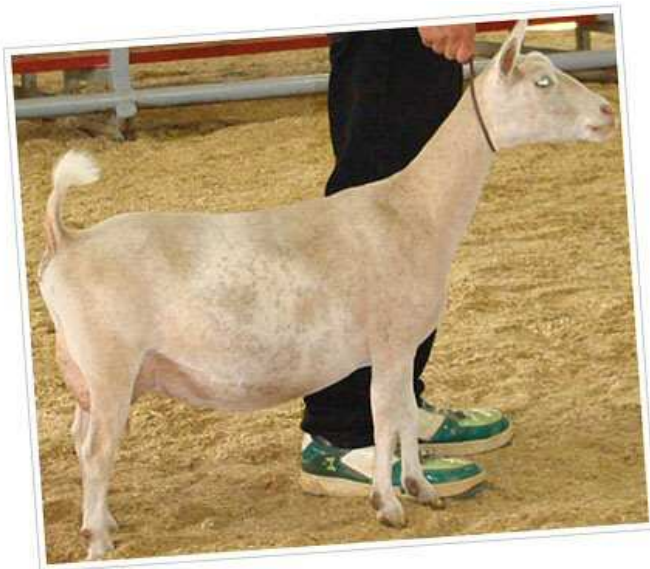
The 2008 ANDDA Total Performer

GCH AGS PromisedLand CP Lil' BoPeep *M E92 (ADGA) ARMCH PromisedLand CP Lil' BoPeep *D E90 (AGS)